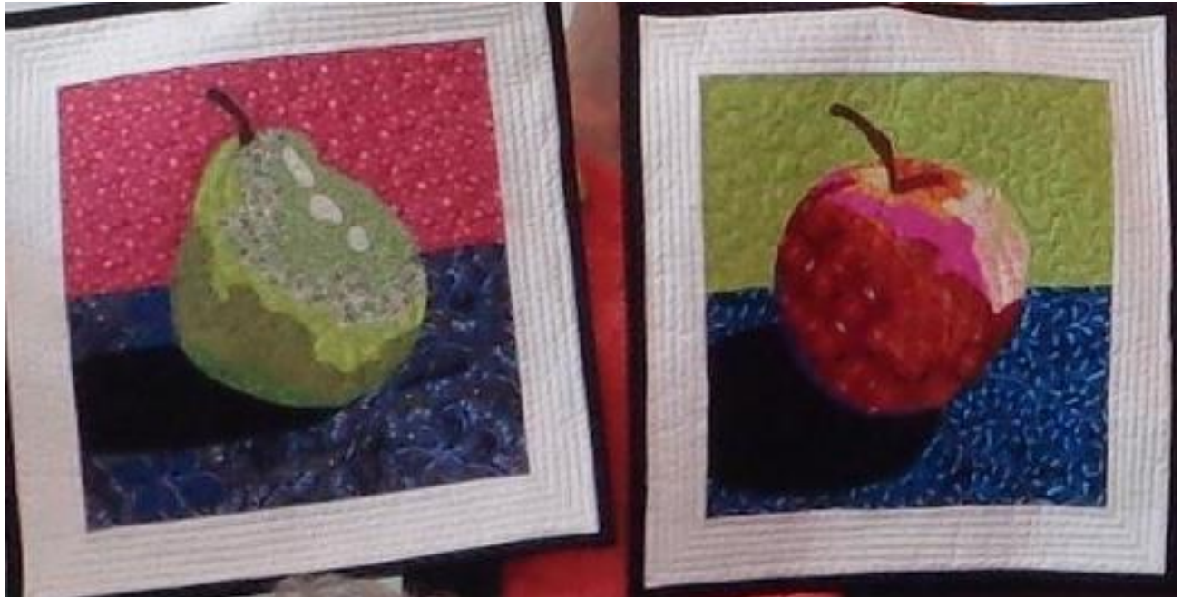
Double reverse appliqué class by Ellen Lindner