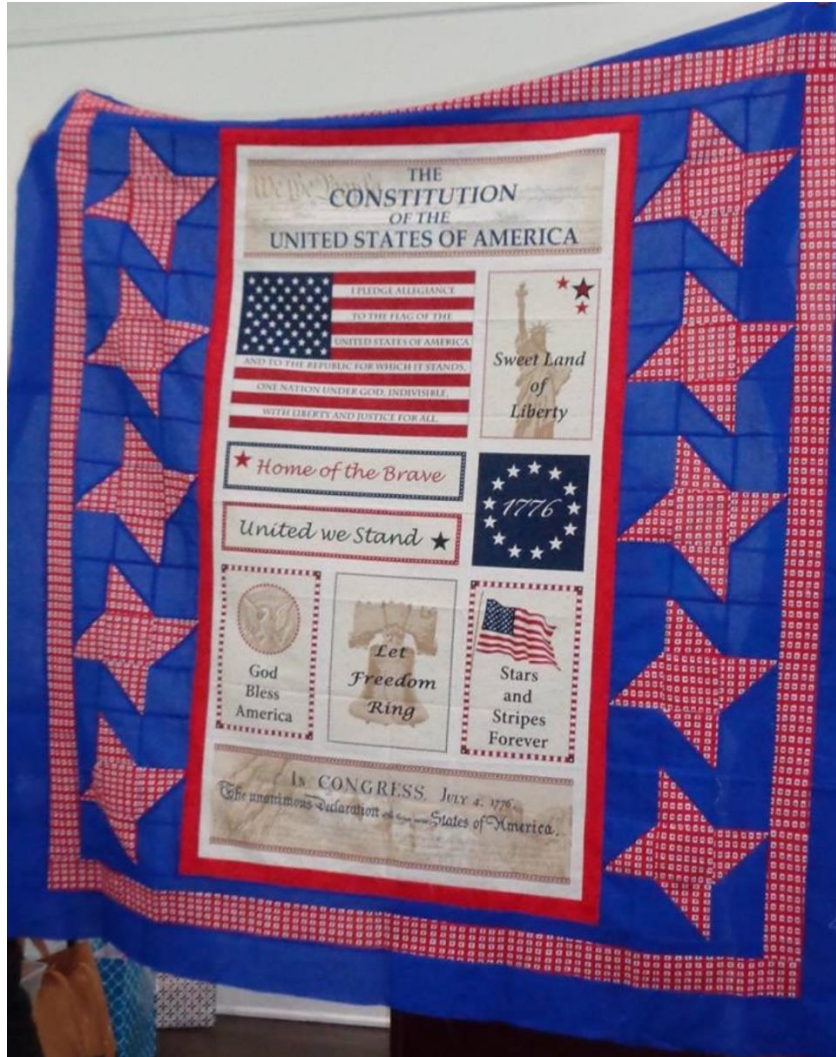
Quilt of Valor