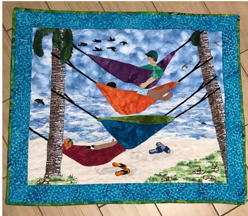
Landscape quilt workshop