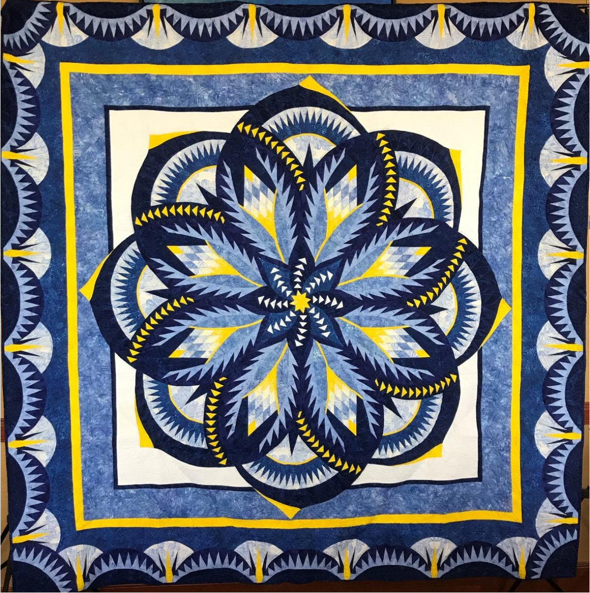
2019 Opportunity Quilt - raffle to raise money for the Florida Sheriff's Youth Ranch